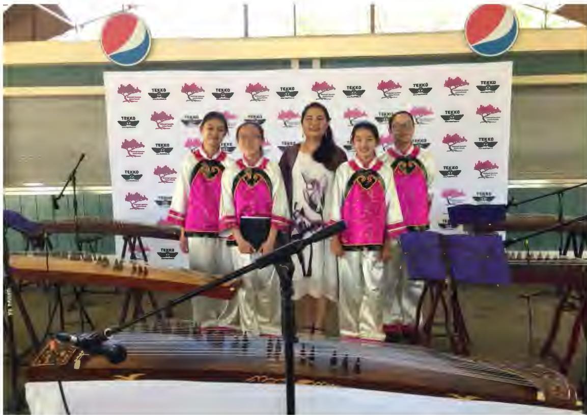
古箏班學生 5/19/18 在 Kennywood 表演。Guzheng class students performed at Kennywood on 5/19/18.