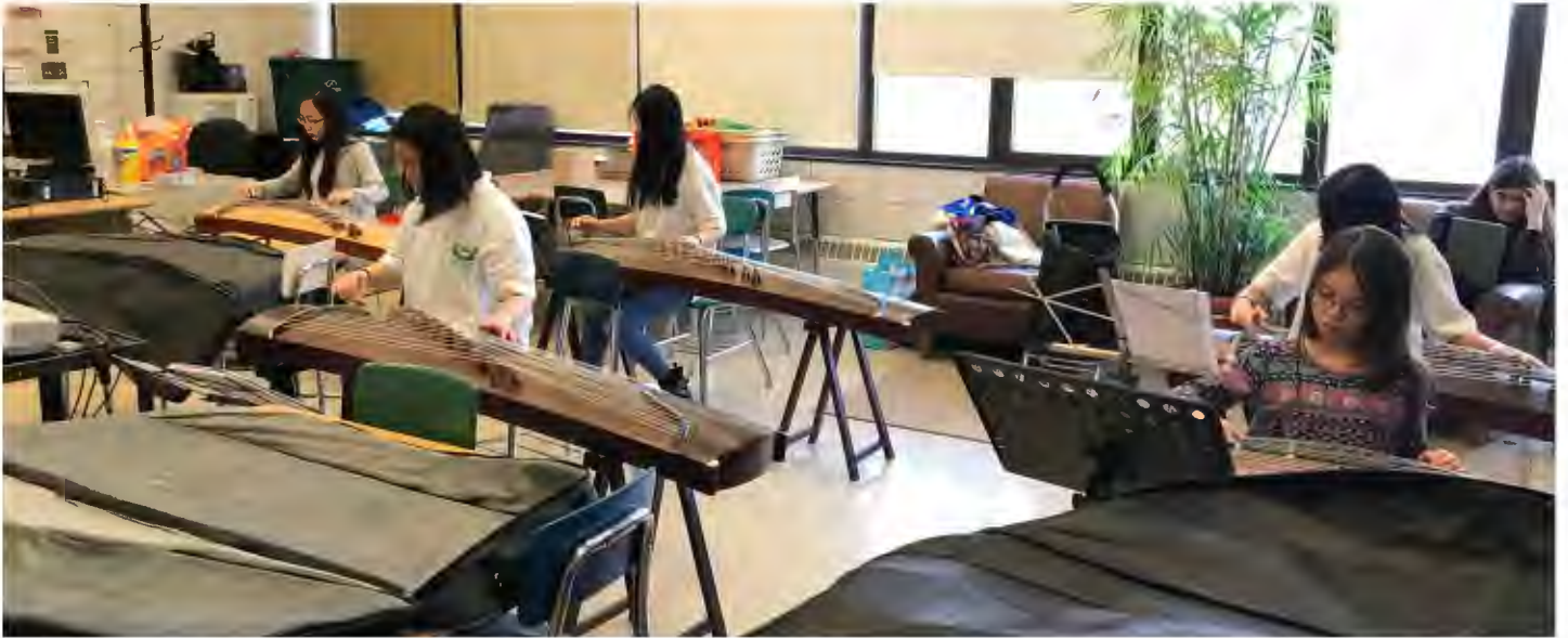
古箏班學生在教室練習 Guzheng class students practice in the classroom